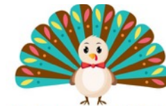
Thanksgiving Food Drive

Please bring to the lobby by October 21. This annual event takes place on Wednesday, October 24 from 6-8pm in the gym. Carnival games, face painting, activities, pie-eating contests, and more! Hot dogs, chips, and a drink served concession-style beginning at 6pm.